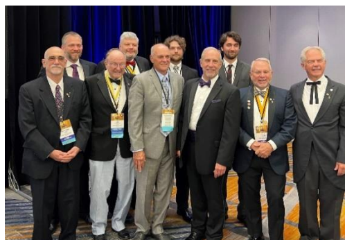
Ten Pi Zetas Attended the Zeta Psi Convention in Brooklyn, NY. Count em, two Actives and 8 Elders