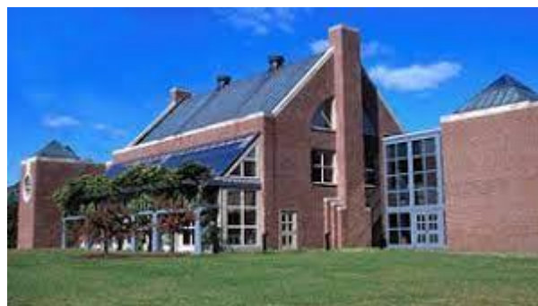
Heffner Alumni House, Peoples Avenue