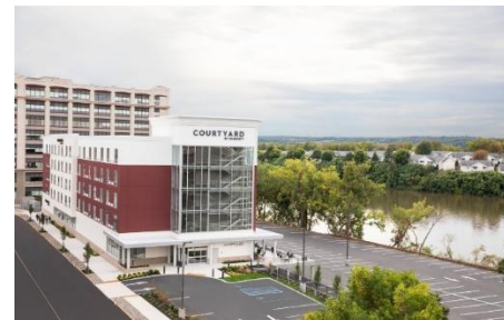
Duh, New Troy. The Albany Troy/Waterfront Hotel