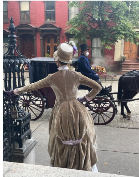
Old Troy, during filming of "The Gilded Age"