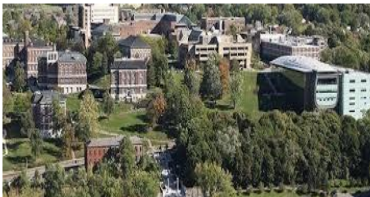
Rensselaer Polytechnic Institute aerial view from the West

From 4:00-5:00 on Saturday we will be treated to a campus tour via bus and a student tour guide. This is a chance to get an overview of recent developments including new housing, renovated old football field, bioscience building, Electronic Media and Performing Arts building, new athletic fields and support building on the east campus near the Field House.