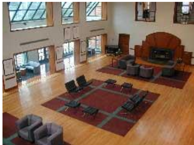
Great Room of the Heffner Alumni House